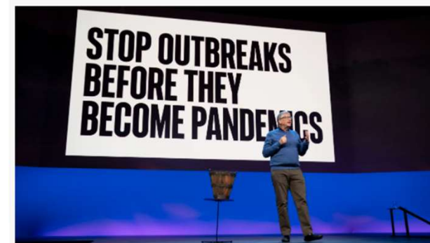
Bill Gates speaking at TED 2022.

At the 2022 TED conference, Gates urged global leaders to create a team of pandemic first responders who would help identify and track emerging viruses.